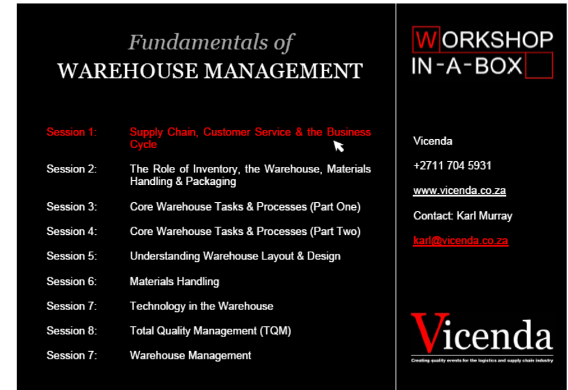
SCREENSHOT OF MAIN MENU

ACCESS CODES: Each unit comes with a unique code that is printed on the back of your DVD box. This code will allow the user access to the interactive Q&A's.