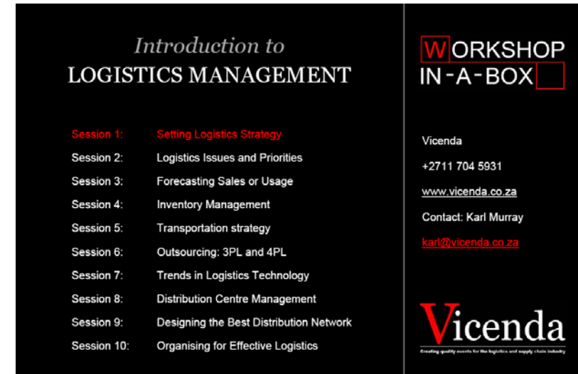
SCREENSHOT OF MAIN MENU

Each unit comes with a unique code that is printed on the back of your DVD box. This code will allow the user access to the interactive Q&A's.