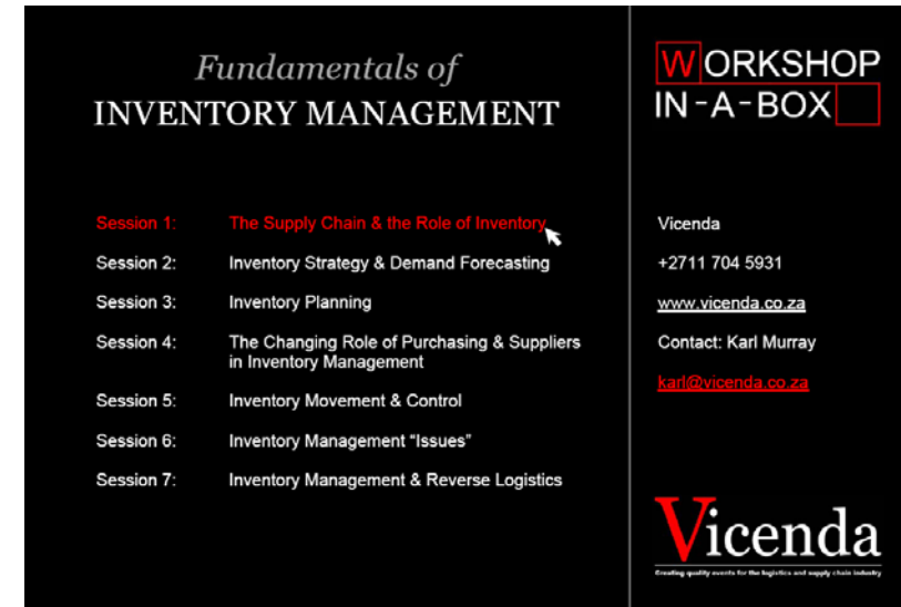
SCREENSHOT OF MAIN MENU

Each unit comes with a unique code that is printed on the back of your DVD box. This code will allow the user access to the interactive Q&A's.